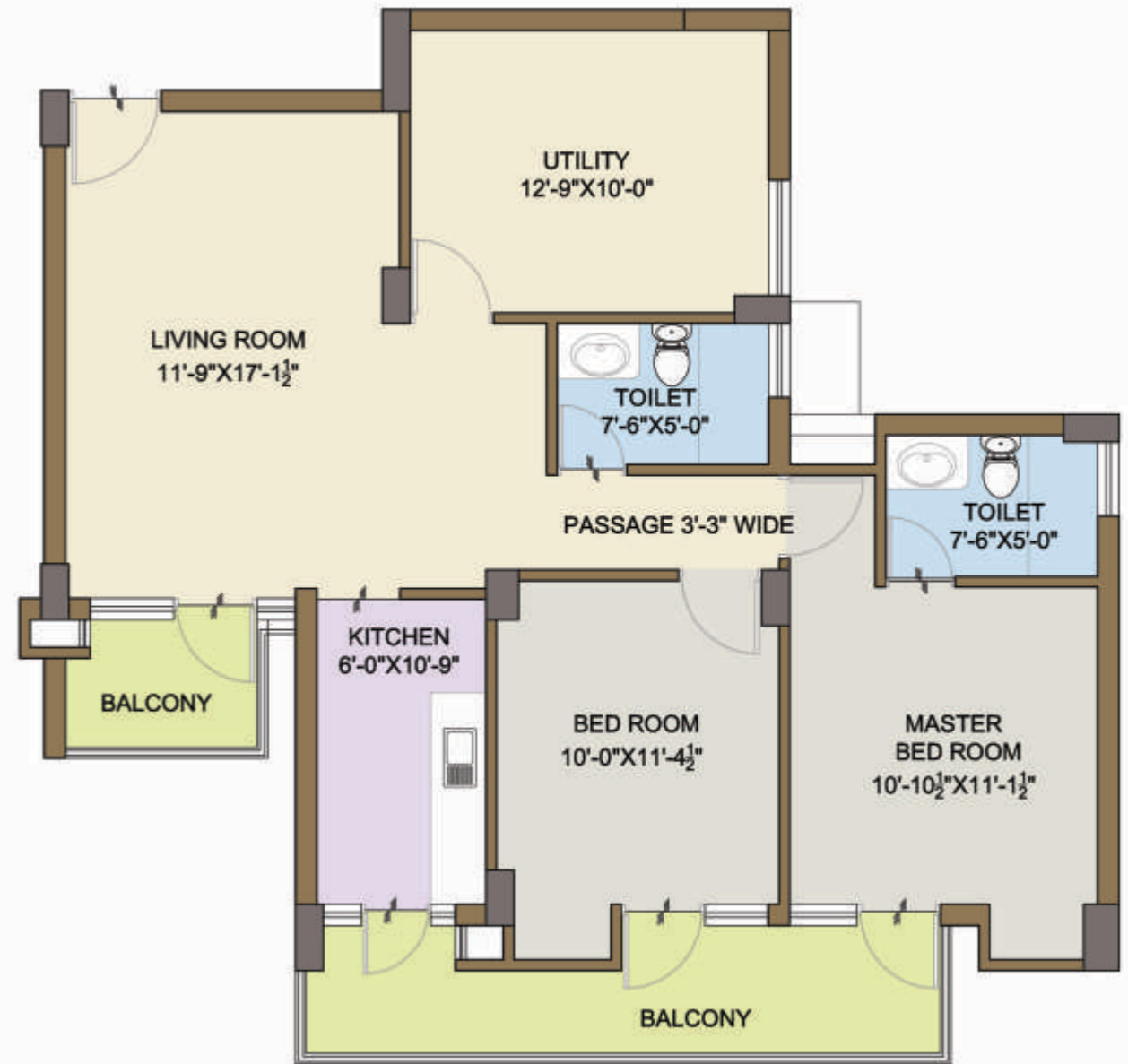
3 Bedroom - 1388 sq. Ft.