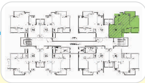
Cluster 2 Bedroom